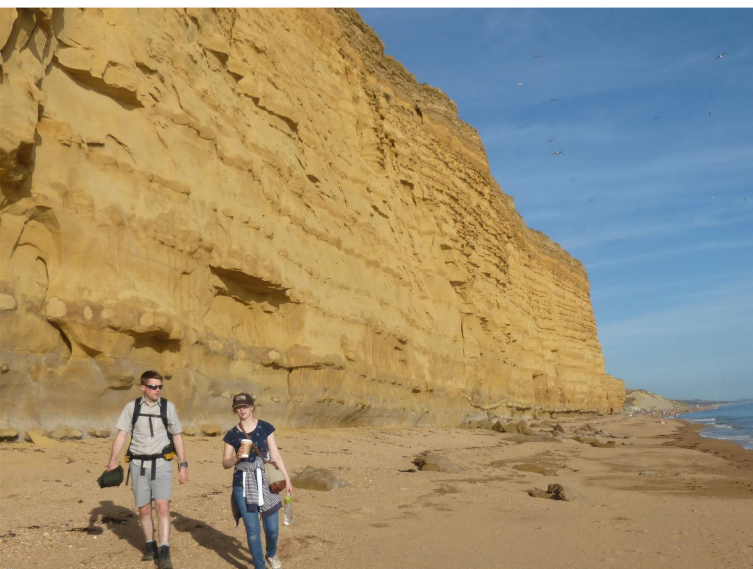
Bridport sands, Dorset