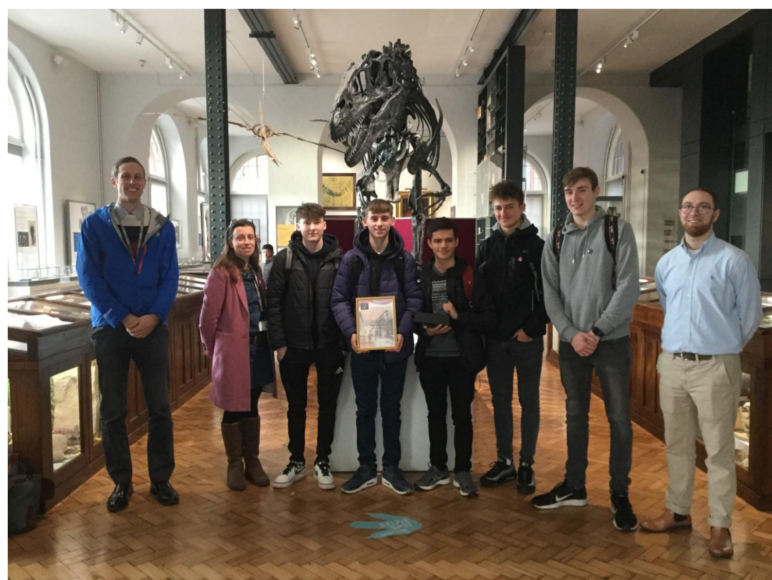
Worcester 6 th Form. Regional School Challenge winners 2020

Download an up-to-date poster from - geolsoc.org.uk/wmrg