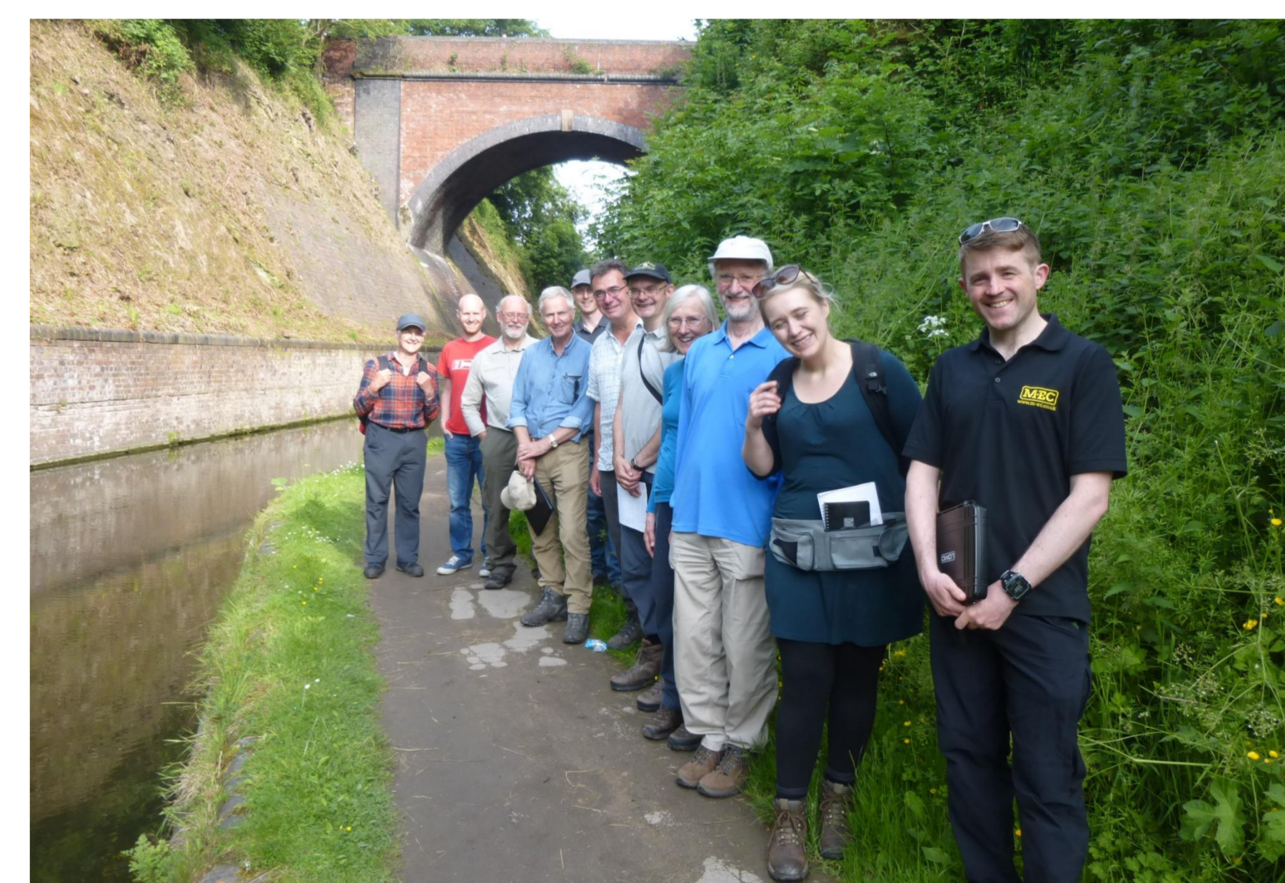
Palaeozoic of the West Midlands - Field trip Participants