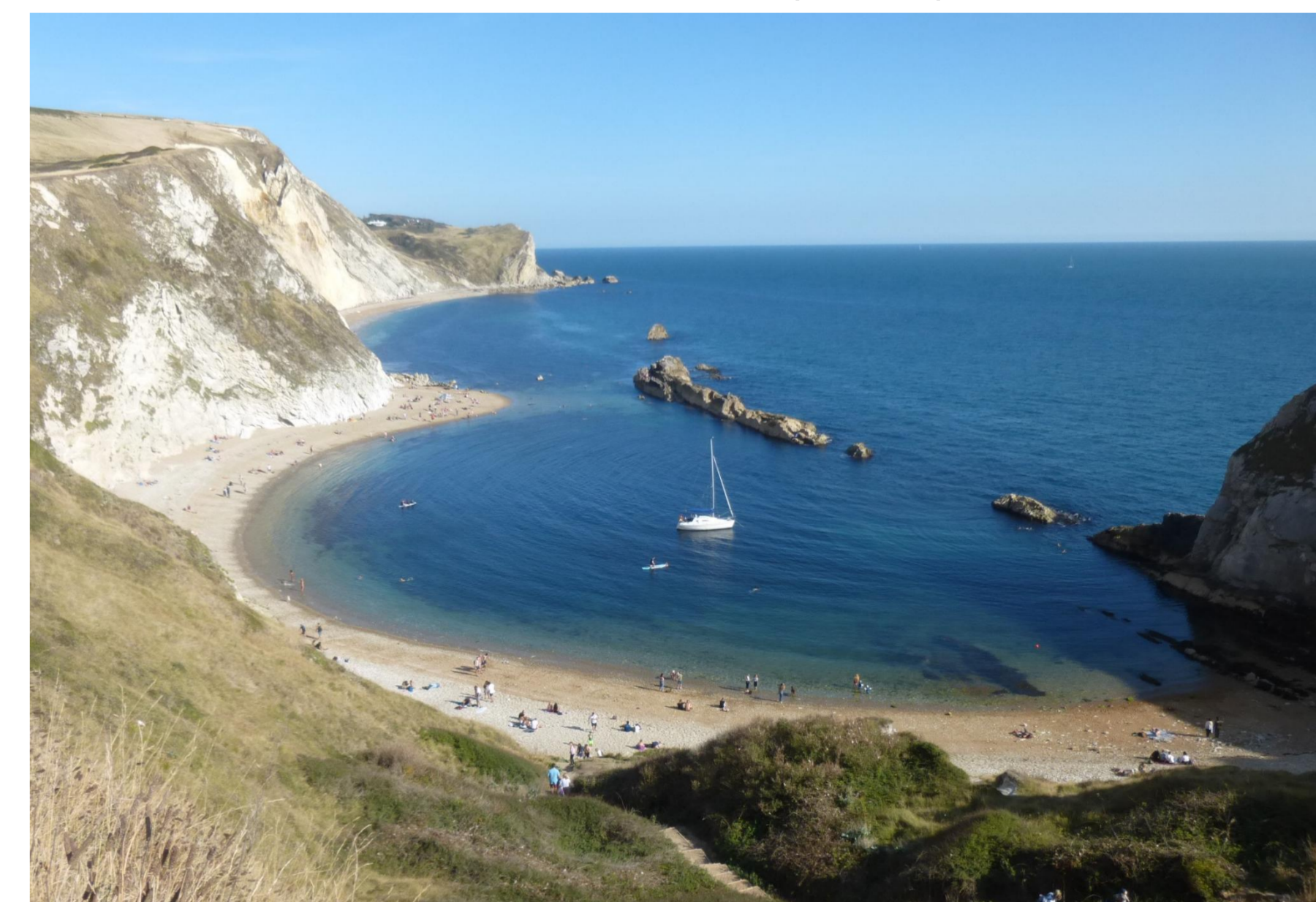
Man o War cove, Dorset