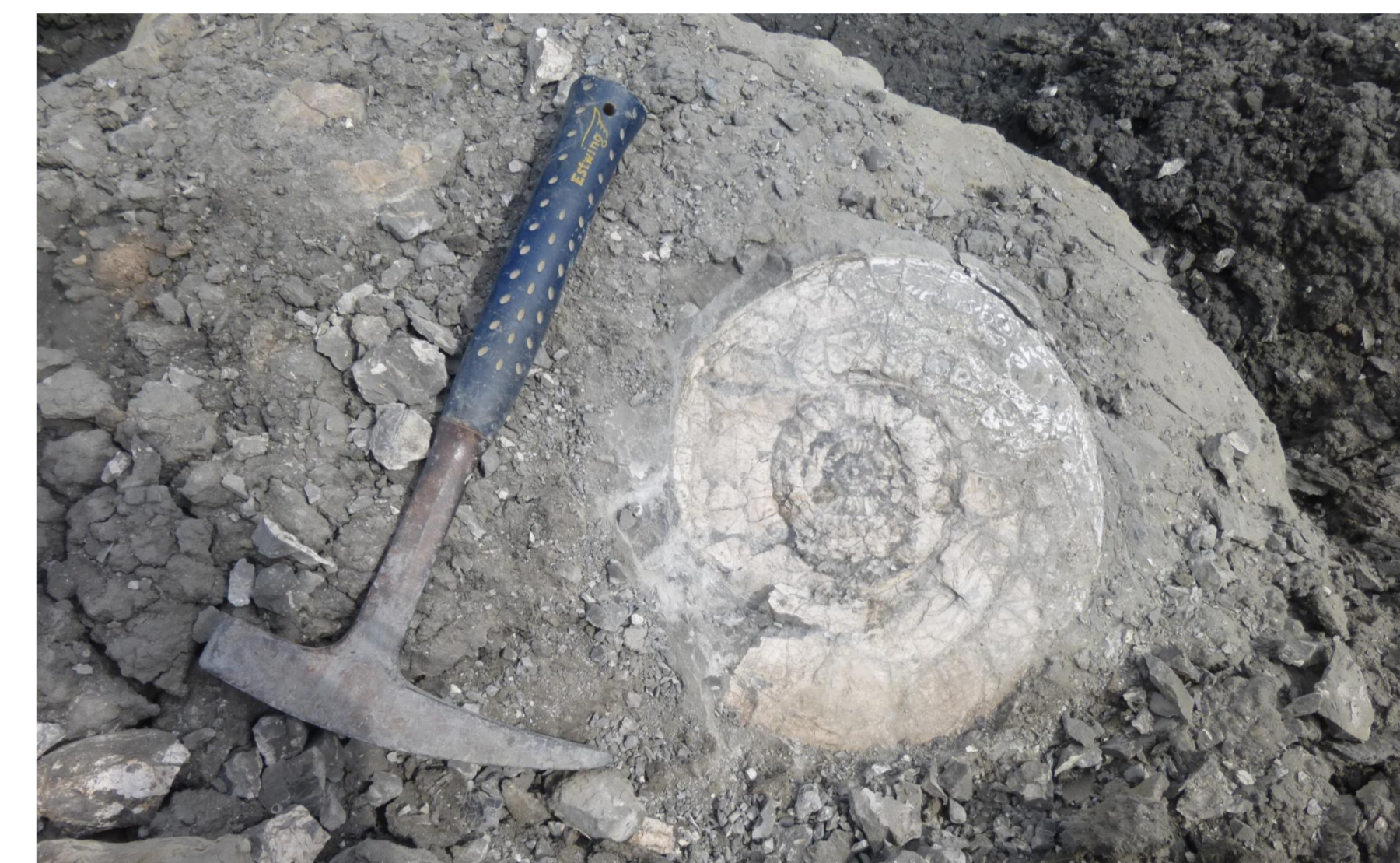
Kimmeridge Ammonite, South Ferriby Quarry