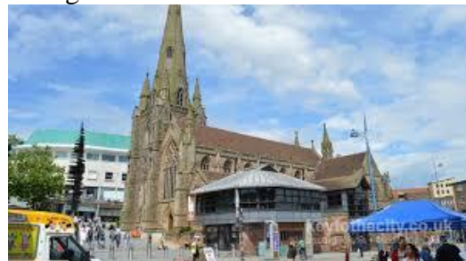
St Martins in the Bullring

Burlington House continues to support the Regional Groups with an Annual Grant for 2019 of £1565. It is anticipated that a similar or slightly larger grant for 2020 will be requested, to avoid a deficit materialising during 2020.