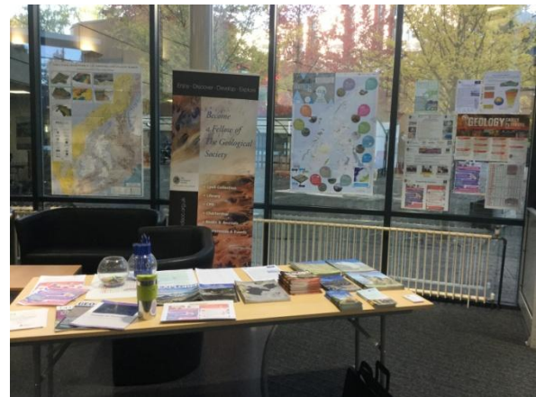
Society handouts and posters (above and below) at Solihull College

The students were also invited to participate in careers advice being held in the foyer among the poster displays we had erected for the event.