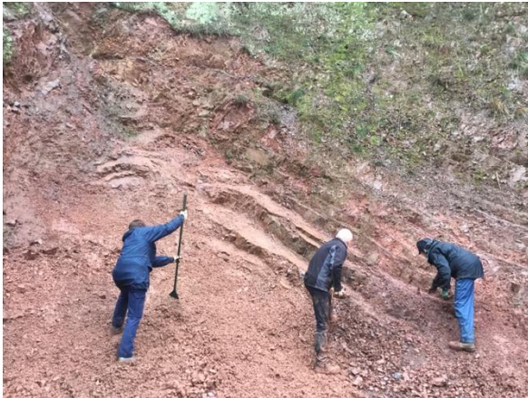
Lickey Hills Geo-Champions maintaining an exposure at Barnt Green Quarry.

The more people that get involved the more work that can be achieved. Not only is it physically rewarding but involvement allows a study of the geology in great detail and complexities can be discussed with peers allowing a far greater understanding than would normally be achieved on a guided field visit.