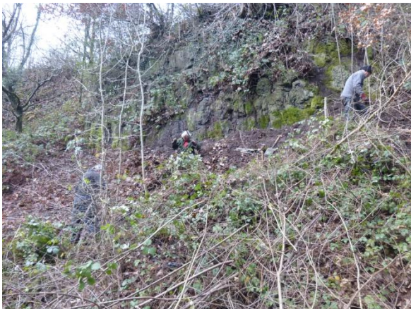
Geo Heroes clearing scrub at Barrow Hill, Dudley. 3 GSL Fellows were involved in this BCGS event.

The groups are always looking for additional help. If you would like to become a Geo Hero with a local group please get in touch and we will try to line you up with a group near you. You will be made to feel very welcome and it is extremely rewarding to boot.