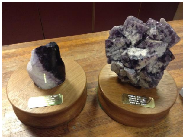
Schools Challenge Trophies: Blue John Fluorite and Fluorite from Weardale Mine, donated by the Weardale Mining Project.

Aquinas won the poster and presentation rounds but were narrowly defeated overall by the quiz round !!