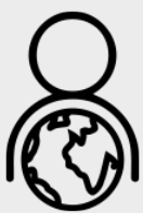
GEOS Geosciences and Society