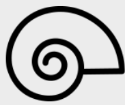
ESSP Stratigraphy, Sedimentology and Paleontology