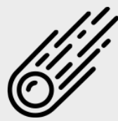
AEGS Emergent Fields in Geosciences