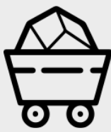
RENE Mineral and Energy Resources for Society