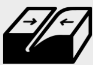
ESEG Structure and Geodynamic Evolution