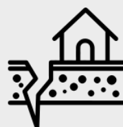
GIAM Engineering and Environmental Geology