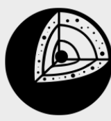
MAGM Magmatism and Metamorphism