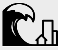
PRIN Natural Hazards and Risks