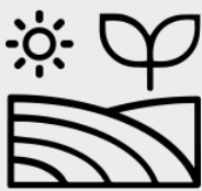
GMPE Geomorphology and Exogenic Processes