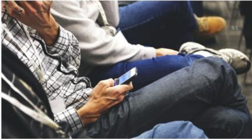
What my family thinks I do