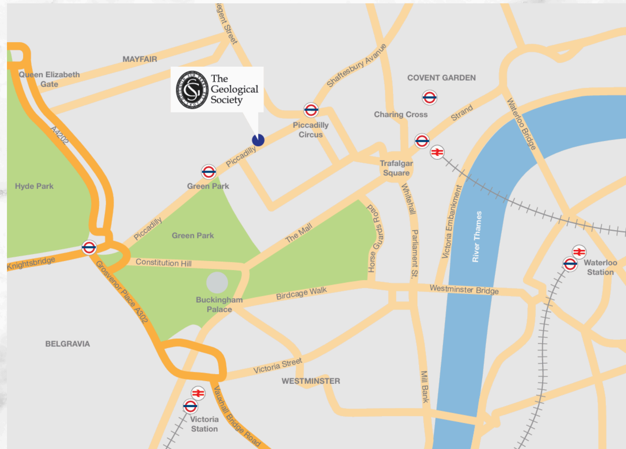
The Geological Society, Burlington House, Piccadilly, London W1J 0BG

Our central location makes it easy for guests travelling from across London and beyond.