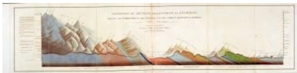
William Smith's Section – Snowdon to London

http://www.geolsoc.org.uk/gsl/site/GSL/lang/en/mapsale